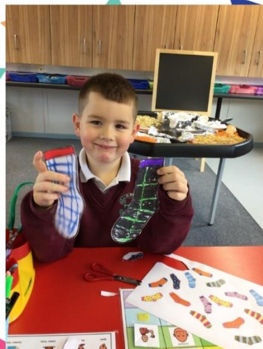
ODD SOCKS DAY IN ASC1