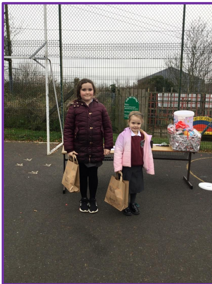
Prizewinners in our Christmas Raffle