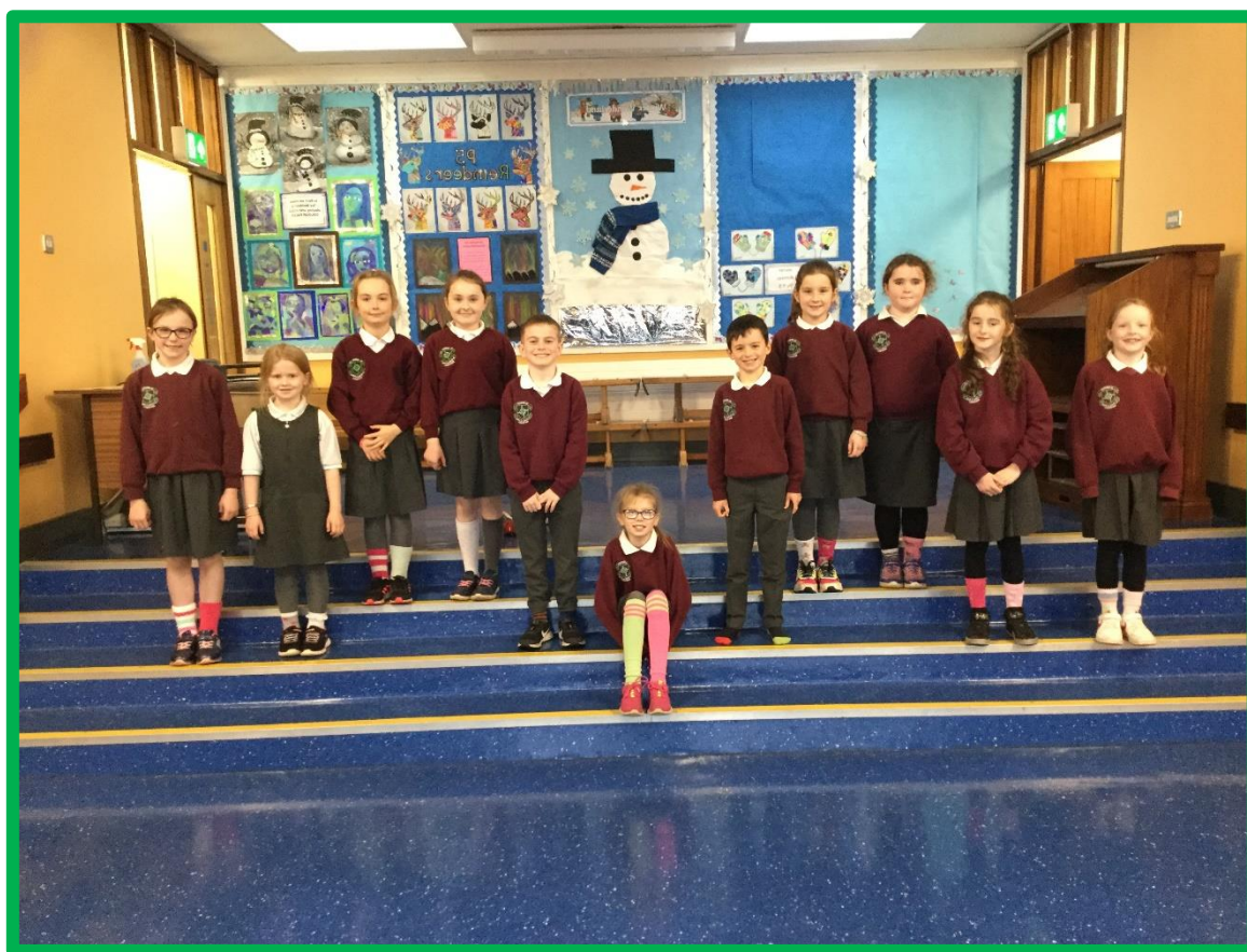
Primary 7 pupils