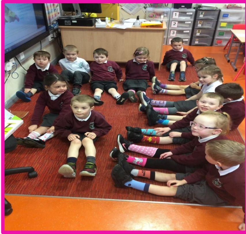
Primary 1/2 Boys and Girls