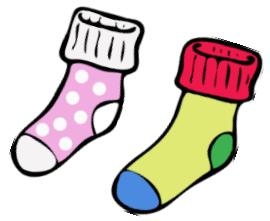
Primary 1 Boys and Girls